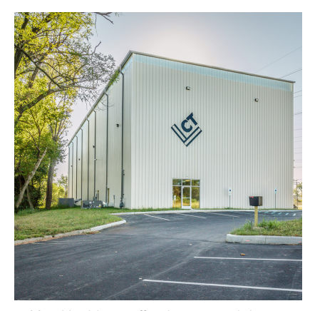
Metal buildings offer the size and design flexibility that makes them perfect for indoor sports facilities.

Butler buildings come with the state-of-the-art MR-24 roof system. This is a premier roof that is sealed with 2,000 pounds of pressure, basically creating a solid sheet of steel over your building. This roof will provide you with peace of mind for generations to come. CCC became an authorized Butler Builder in 1997, and achieved prestigious Career Builder status in 2001. As a Butler Career Builder, CCC is uniquely positioned to offer you access to the highest-quality PEMB systems in the industry.