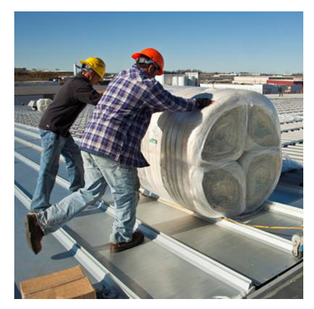
Roofs fail. When that happens, CCC can install a Butler MR-24® Re-Roof.