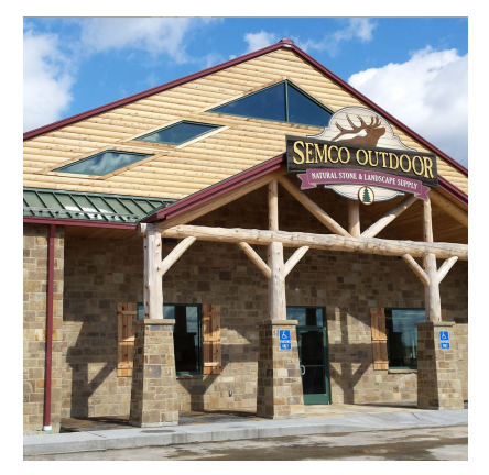
CCC's 3D BIM Virtual Modeling lets you see just how flexible PEMBs can be. Your facility can be fully customized to reflect your design vision and the needs of your business.