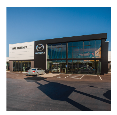
Your success is of the upmost importance. The quality of construction that you receive is essential to your success and satisfaction.