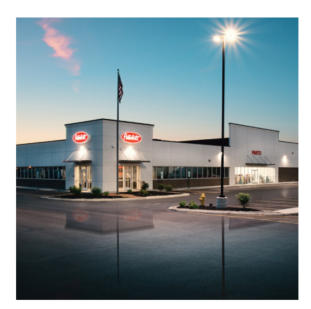
When constructing additions and exterior renovations the new should seamlessly blend with the old. That's what you want and that is what you will receive.

Each project presents a different set of challenges. This requires a team that will know how to facilitate the construction process with various municipalities, while staying focused on the standards and procedures that will make the project a success. CCC's method of effective communication and transparency assures clients that their resources and community projects are protected by a trusted partner.